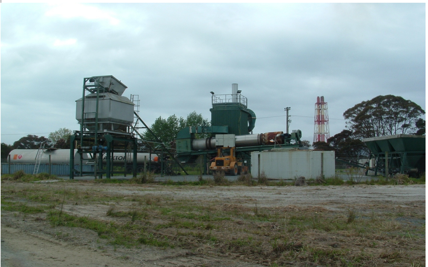
This is the plant which Blacktop Construction Ltd propose to relocate to Riverlea Road

Kind regards from the Committee of the Riverlea Environment Society Inc.