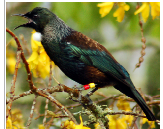
A tui seen feeding in Hammond Park this spring