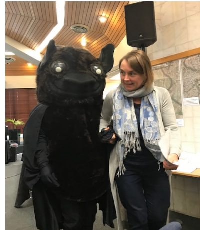
Pekapeka (bat) making a guest appearance at the Amberfield Resource Consent hearing.

The developer appealed to the Environment Court to remove or weaken some of the Commissioners' ecological conditions. Initially, RESI